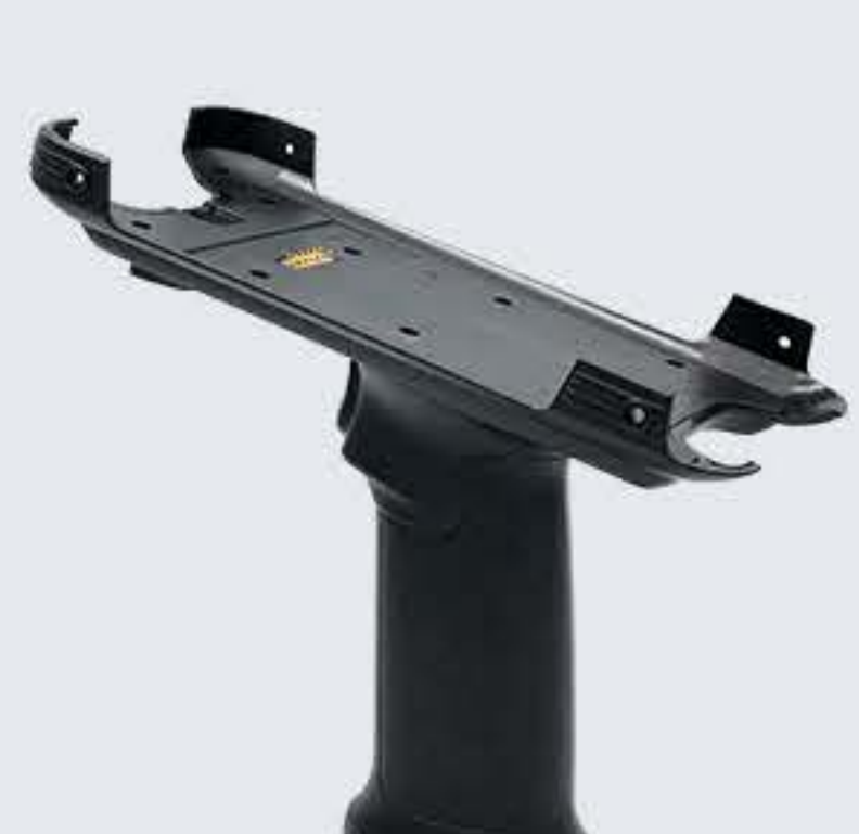
RB-C66-PS Snap-On Trigger Handle and Rugged Boot Kit, use with optional pistol battery 4 pcs M1.6 screws are necessary.