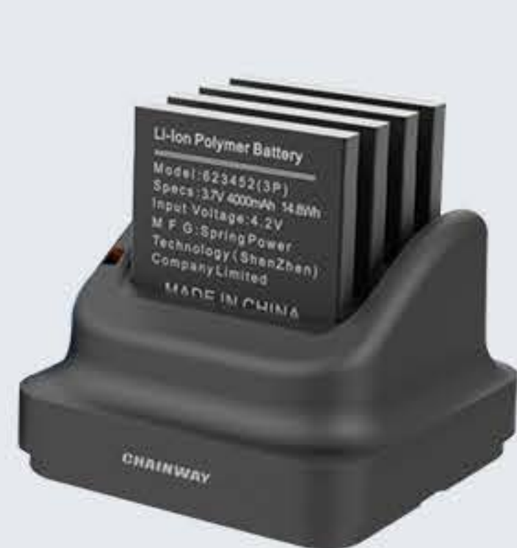
CRD-C66-MBC Charging Cradle for main battery, up to 4 slots, use with DCPWR-12V2A-XX adapter.