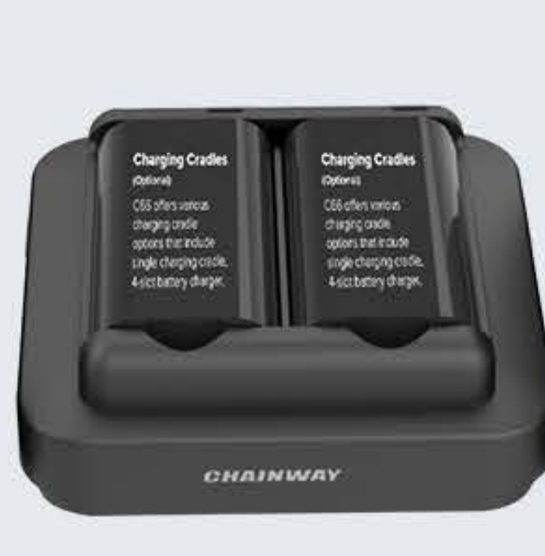
CRD-C66-PBC Charging Cradle for pistol battery, up to 2 slots, use with DCPWR-12V2A-XX adapter.