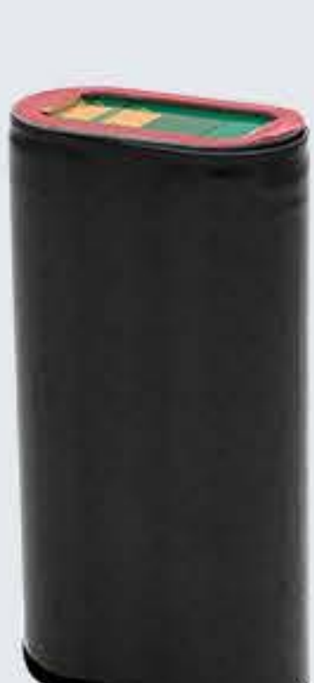
BTY-C66-PB Pistol battery, 5200mAh