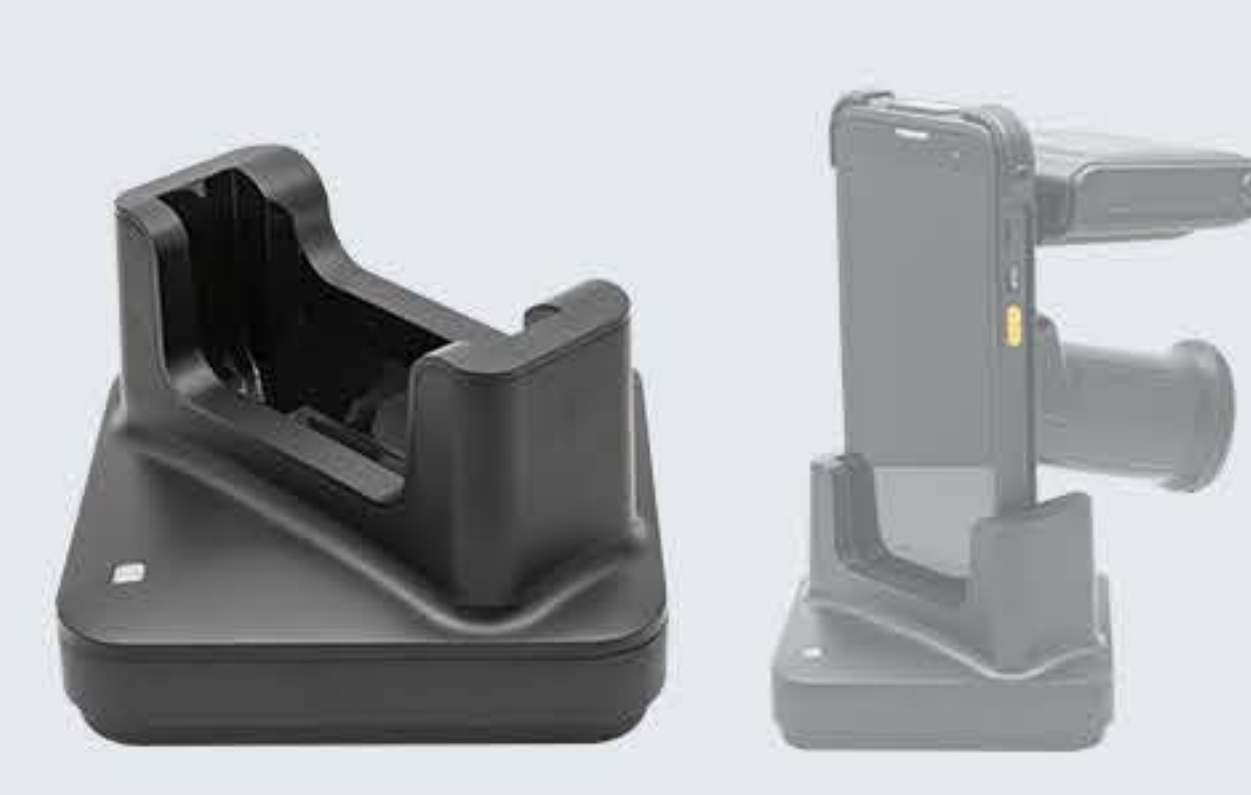
CRD-C66-DP C66 charging cradle, only for device with pistol grip or device with UHF, use with DCPWR-12V2A-XX adapter.