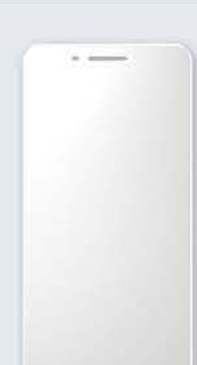
SP-C66 Tempered glass screen protector