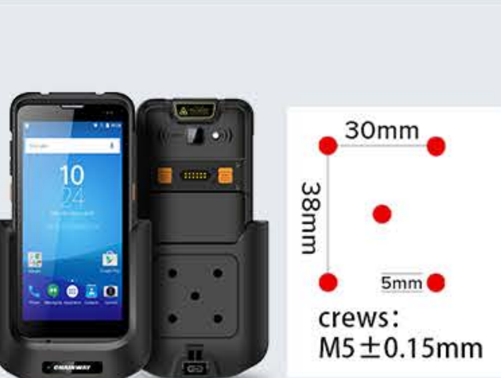
CRD-C66-VC Vehicle Charging Cradle, with type-C, use with DC-BK-TypeC cable. Car holder and car adapter need to be purchased separately