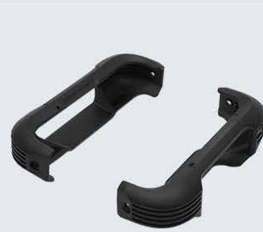
RB-C66-PR Protective rubber bumper, upper and lower 4 pcs M1.6 screws are necessary.