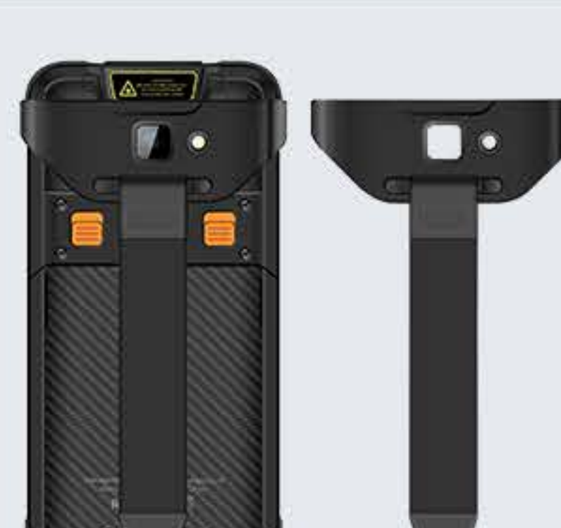
RB-C66-HS Hand strap with buckle 2 pcs M1.6 screws are necessary.