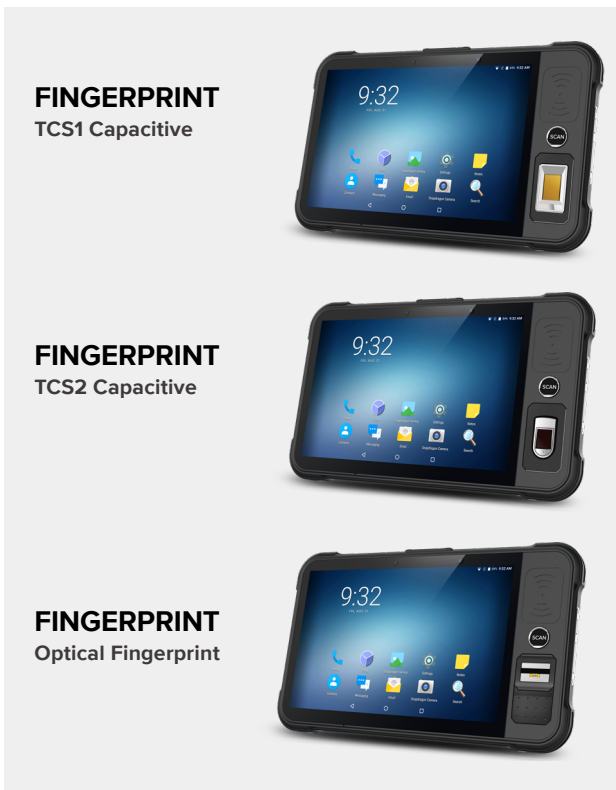
FINGERPRINT TCS1 Capacitive

Accurate Fingerprint Reading and Facial Recognition